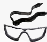
STRAP + FOAM KIT #KITFSCOB